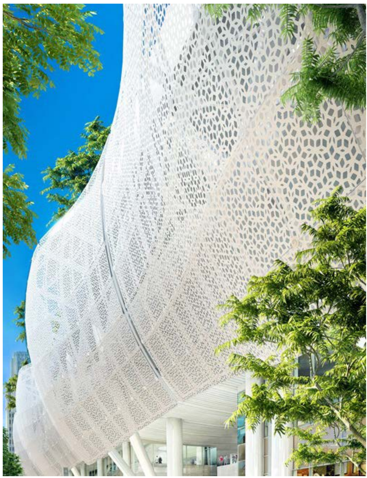
View of Transbay Transit Center from Natoma Street

"I am delighted that the Transbay Transit Center has chosen to employ a non-periodic 5-fold quasisymmetric mathematical pattern that I discovered in 1974, in order to adorn the exterior skin of their magnificent project, in this most impressive design," said Dr. Penrose. "The existence of such patterns was very unexpected, since they appear to violate the standard symmetry rules of crystallography. Yet they reveal hidden aspects of mathematical structure, some of which had been hinted at earlier in the works of the great 17th Century astronomer Johannes Kepler, and also, to some extent, in ancient Islamic designs," he said.