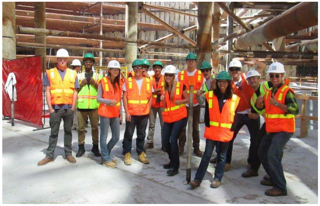
Cal Poly students visit the Transbay site

As one of the largest infrastructure projects in the country (and currently the largest construction project in the Bay Area), construction of the new Transbay Transit Center provides an excellent learning opportunity for students interested in a wide range of fields, including construction, engineering and project management. In July, 16 students from Cal Poly received an in-depth project presentation and tour as part of a summer course on construction management. Speakers affiliated with various contractors working on the project covered a variety of topics from preconstruction to bid strategies to management of heavy equipment. The TJPA is strongly committed to creating these kinds of learning opportunities for the students who will lead our nation's infrastructure development in the future.