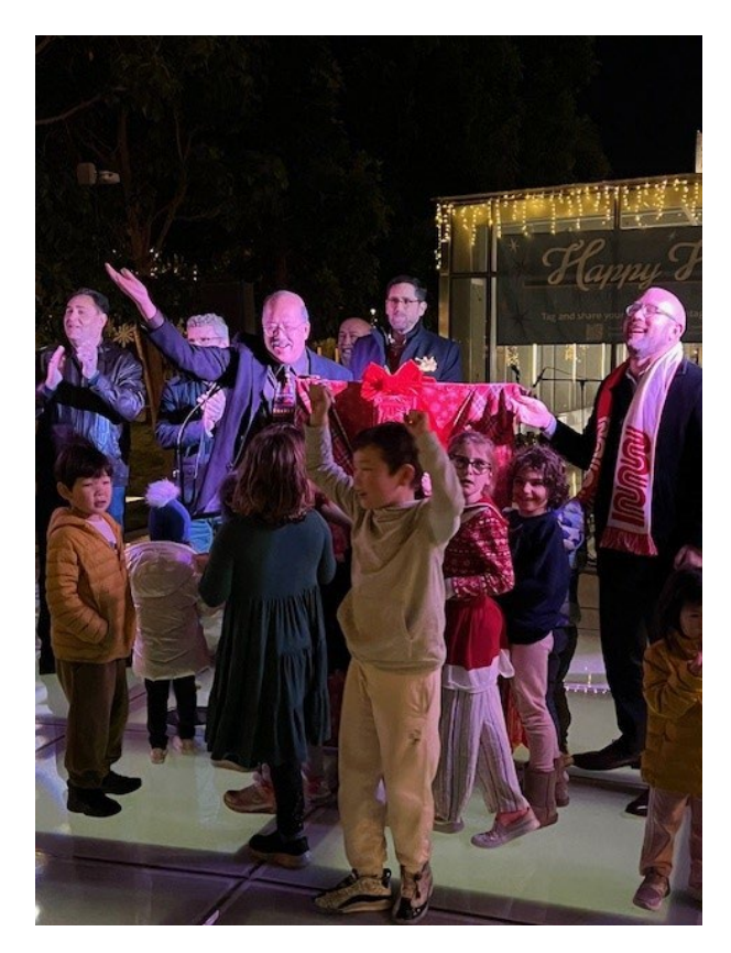
4<sup>th</sup> Annual Winterfest: Holiday Lighting Celebration